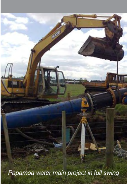
Papamoa water main project in full swing