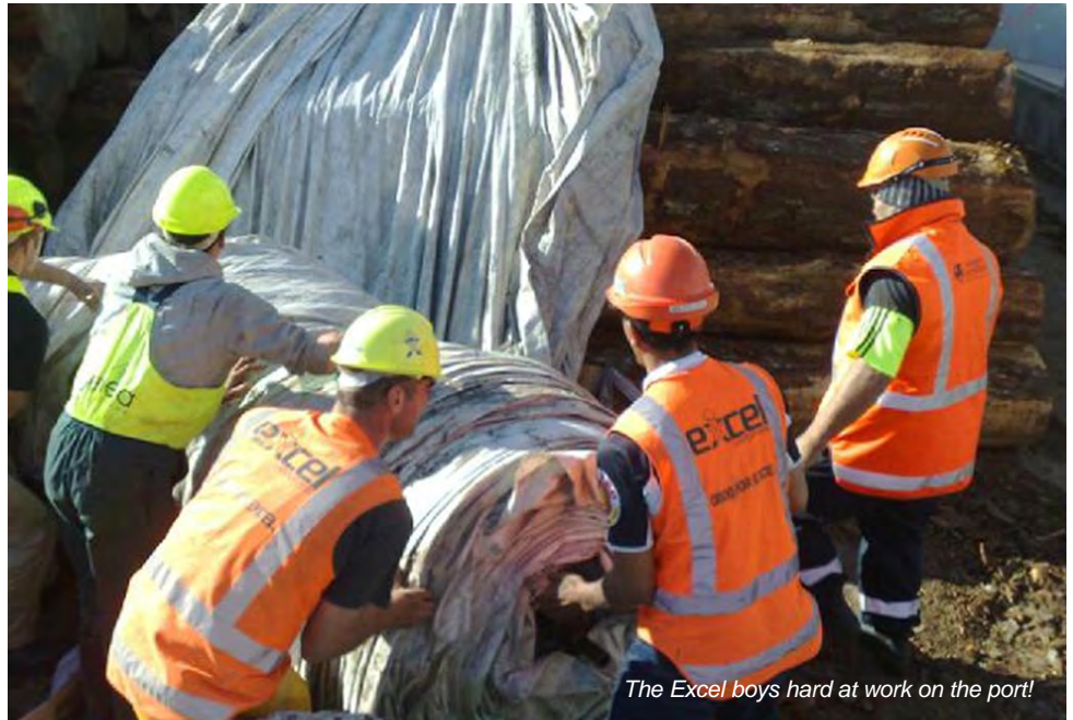
The Excel boys hard at work on the port!

In conjunction with ACC and their habitat work website we have found some invaluable tips that are specifically set up for industrial workers. Next time you get 5 minutes click on www.habitatwork.co.nz and check it out. There is some great work alternatives and exercises to better prepare you for your working day and keep you injury free. This is a must if your role requires a lot of manual handling. We even looking at getting a link to this site from ours. Any suggestions or contributions to this topic would be welcomed.