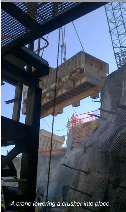
A crane lowering a crusher into place

What we are still seeing is a big increase in temp staff numbers being employed as opposed to permanent appointments. Another trend is the number of employers who are employing temp staff and using them on a "very casual" basis ie: Temps coming in for half-day jobs and temps working weekends to give the permanents some time off etc.